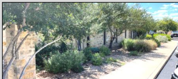
Our native landscaping is managed by monthly volunteers who keep our gardens looking beautiful. Special thanks to all of them for their hard work.

Where: The Good Samaritan Center, 140 Industrial Loop, FBG (off Hwy 290 E, just past the Law Enforcement Center)