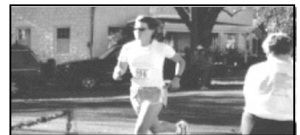
The Fredericksburg Athletic Club's Weihnachten 5K Fun Run on Sunday, December 3, at 2pm will benefit The Good Samaritan Center

The Fredericksburg Athletic Club's Weihnachten 5K Fun Run is on Sunday, December 3, at 2pm. We are proud that this event is one of the few winter events that promotes good health and family fun. See the enclosed flyer for registration information.